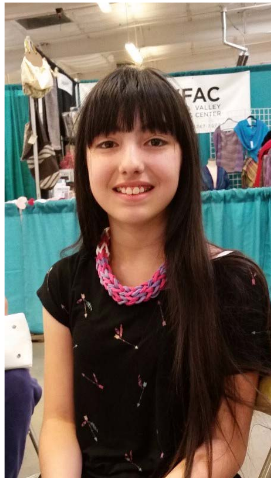
Pink Beauty and her necklace.