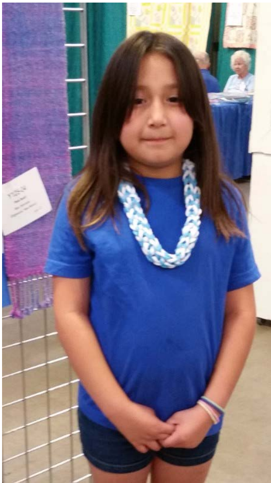
Blue Beauty and her necklace