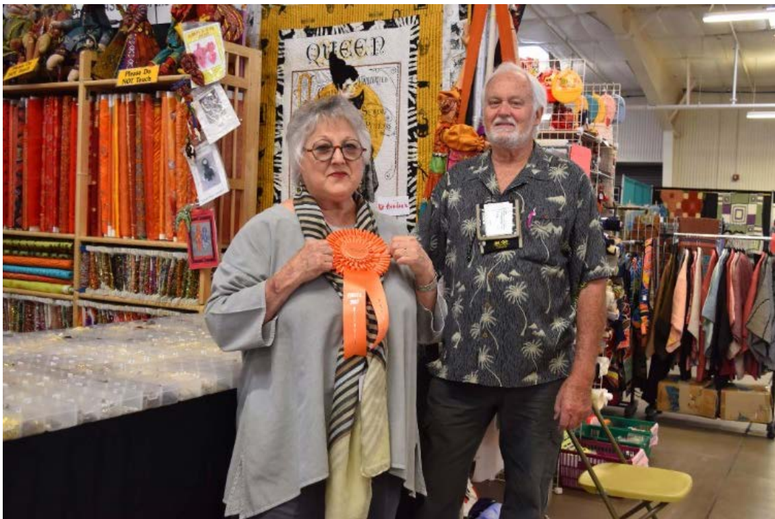
Favorite Vendor booth - Treasures of the Gypsy.